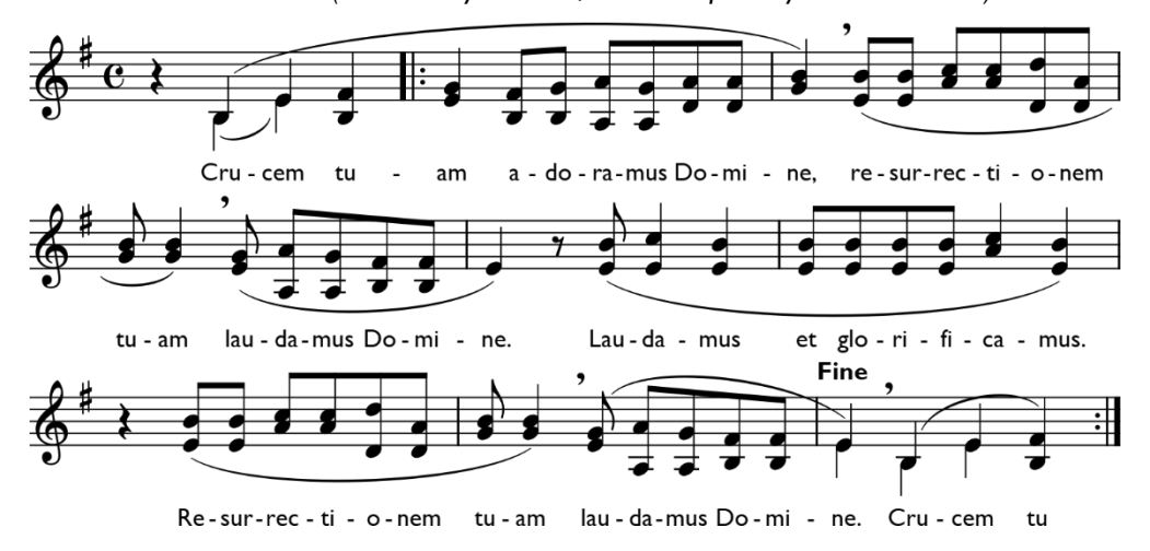
Chant 2 Crucem tuam (We adore your cross, Lord. We praise your resurrection.)