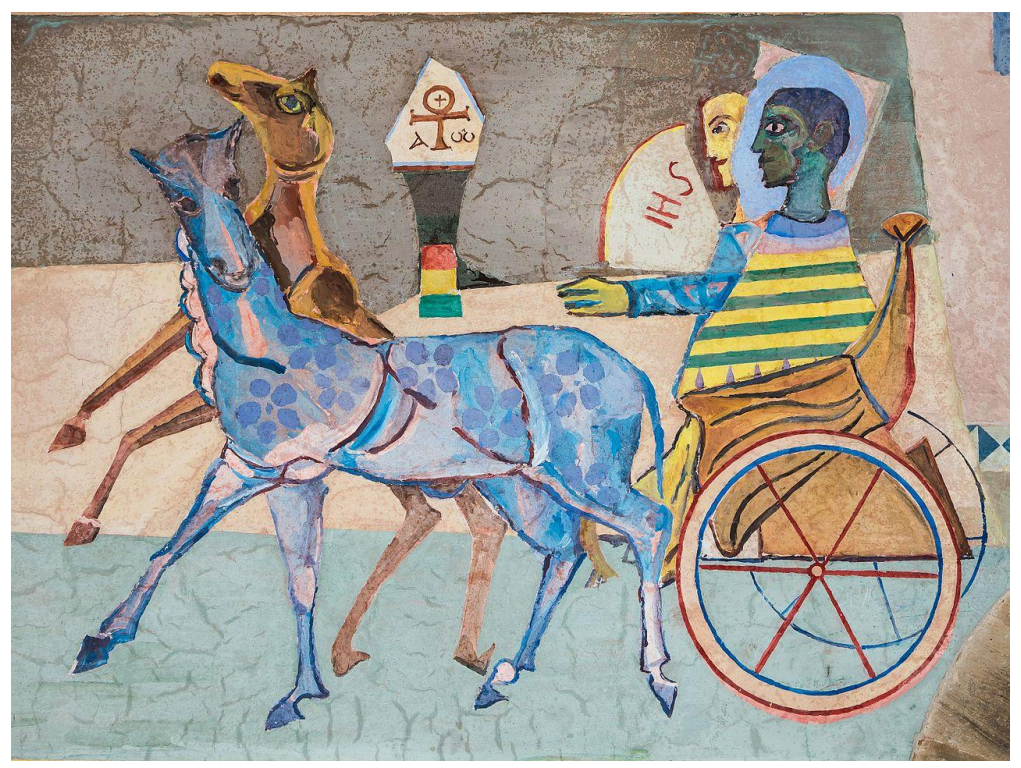
Philip and the Ethiopian Eunuch – Herbert Boeckl