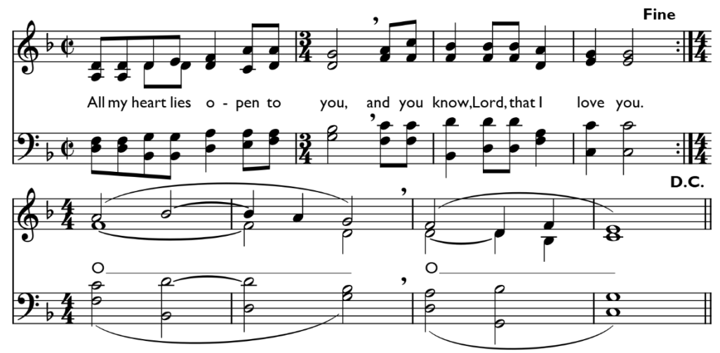
Chant 5 All my heart lies open to you

Our Father, who art in heaven, hallowed be thy name; thy kingdom come; thy will be done; on earth as it is in heaven. Give us this day our daily bread. And forgive us our trespasses, as we forgive those who trespass against us. And lead us not into temptation; but deliver us from evil. For thine is the kingdom, the power, and the glory for ever and ever. Amen.