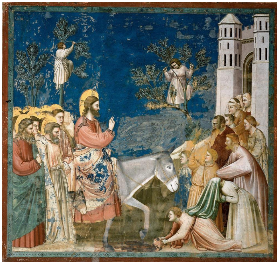
The Entry into Jerusalem, c1305 – Giotto