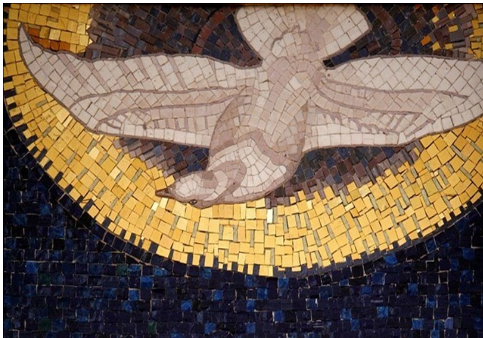
Holy Spirit mosaic, Vienna, Austria